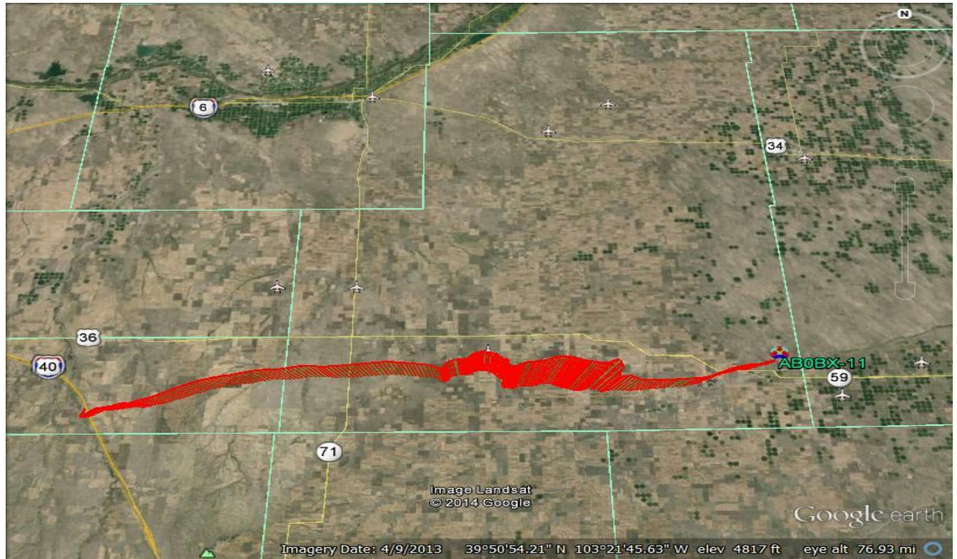
View Looking North I-70 and Deer Trail launch point on left, Actual landing site was several miles ENE or to the right of the last beacon, in open country